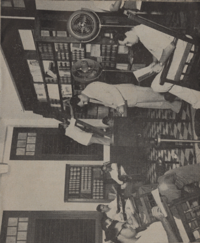
ONE OF THE LIBRARIES OF THE AGRUPACION