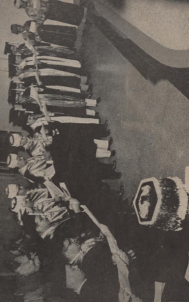
SODALIST UNIVERSITY PROFESSORS PLEDGING THE "OATH" OF PIUS X AGAINST THE ERRORS OF MODERNISM