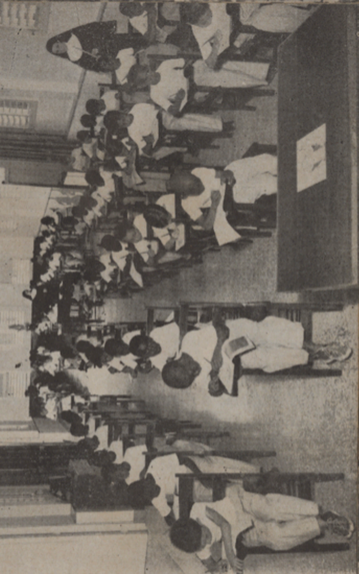
TWO OF THE BEAUTIFUL CLASSROOMS OF THE SCHOOL-DISPENSARY, FULL OF CHILDREN IN UNIFORM. THREE SISTERS OFFER CLASSES TO 300 CHILDREN, ASSISTED BY YOUNG WOMEN VOLUNTEERS