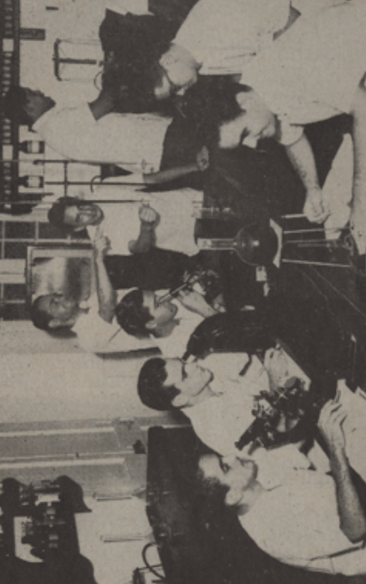
THE LABORATORY OF THE MEDICAL STUDIES INSTITUTE, LED BY THE AGRUPACION