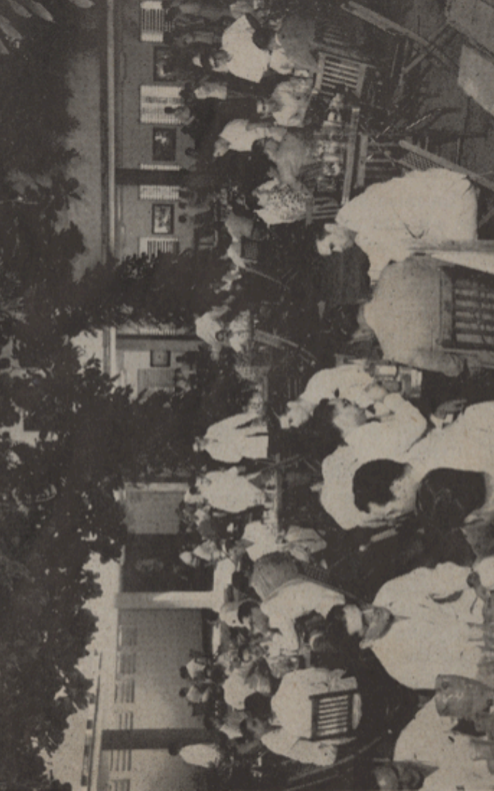
AFTER MASS COMES BREAKFAST ON THE BEAUTIFUL PATIO OF THE ACU