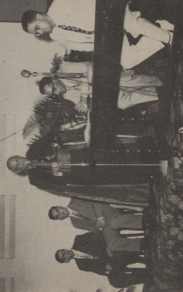
THE ANNUAL APOSTOLIC ASSEMBLY, PRESIDED BY HIS EMINENCE THE CARDINAL OF HAVANA