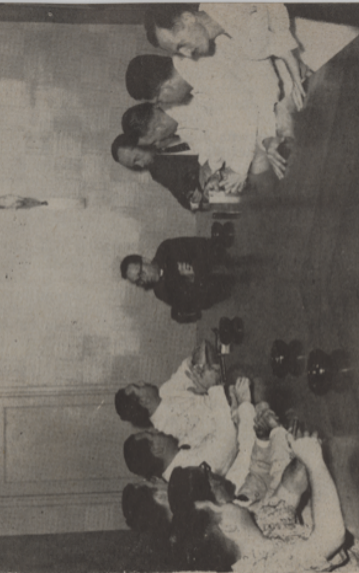
THE BISHOP OF MATANZAS PLANS THE "MODEL PARRISH WITH MEMBERS OF THE ACU BOARD