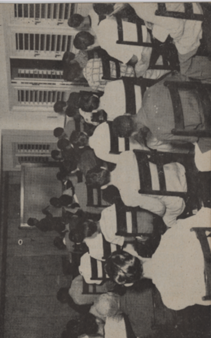
AN AGRUPADO NIGHT-SCHOOL TEACHER OF LABORERS IN THE SCHOOL-DISPENSARY