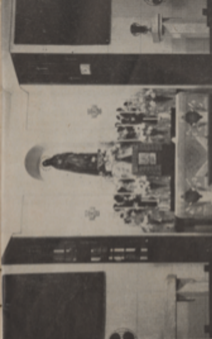
ALTAR OF THE CHAPEL. THE VIRGIN PRESIDES THE ALTAR AND THE ENTIRE AGRUPACION