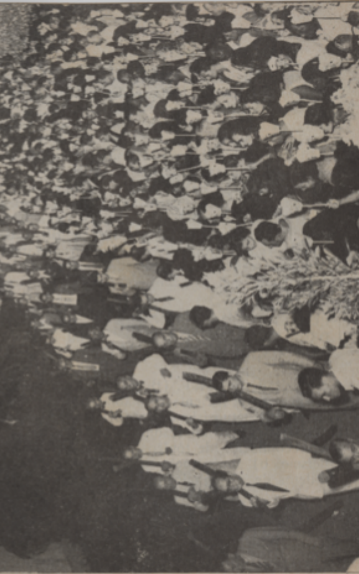
THE AGRUPACION CREATED AND ORGANIZED THE GREAT VIA CRUCIS ON CALVARY, ATTENDED BY MORE THAN FIFTEEN THOUSAND FAITHFUL