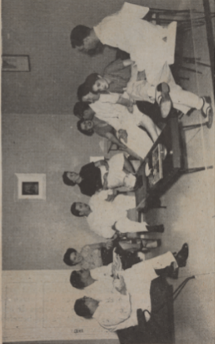
FOUNDING MEMBERS OF FAMILY "CANA" GROUPS, DURING ONE OF THEIR WEEKLY SESSIONS.