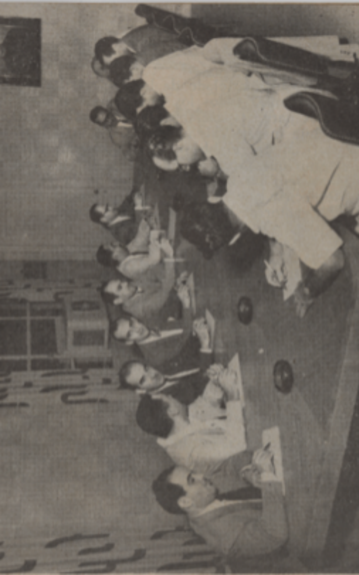
ACU BOARD OF DIRECTORS