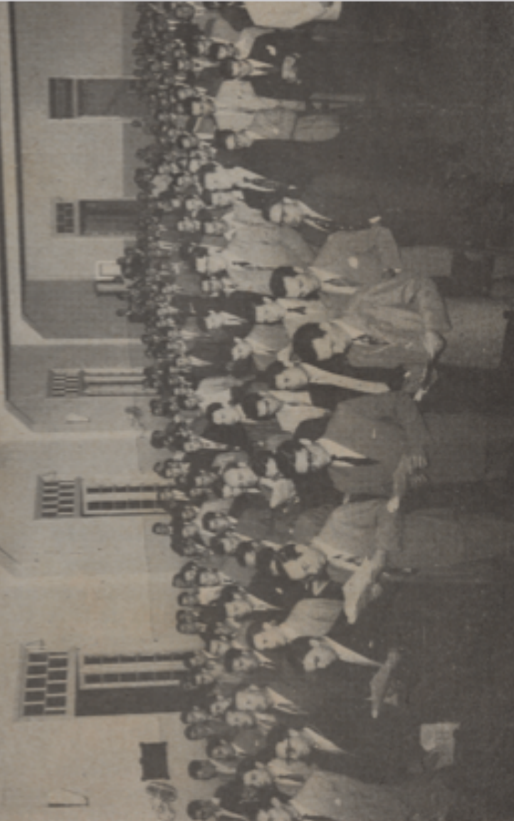
THE YEAR'S MOST SOLEMN ACT. THE CONSECRATION OF SODALISTS ON THE DAY OF THE IMMACULATE CONCEPTION