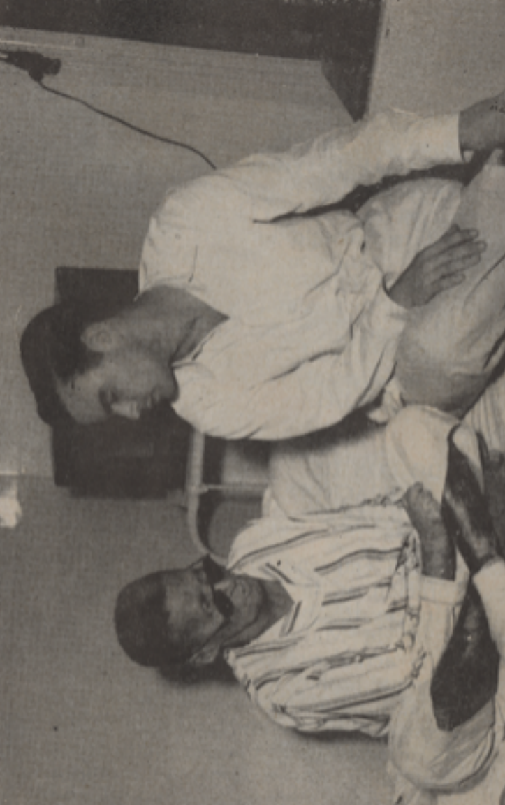
SODALISTS VISITING LEPERS