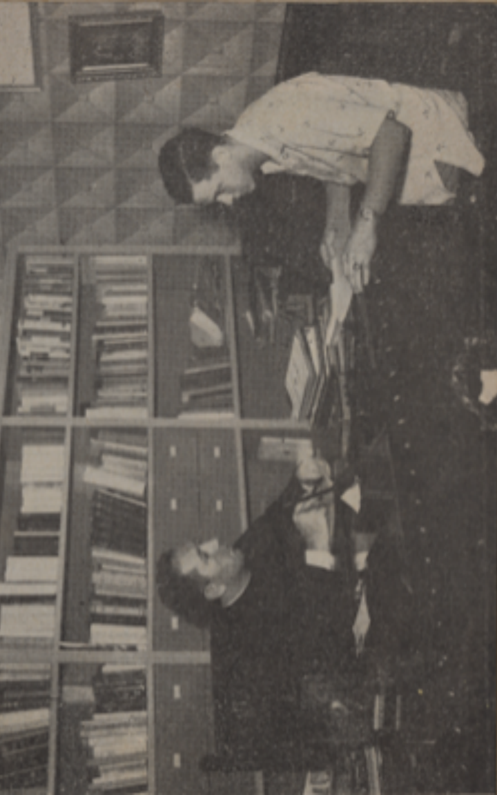
OFFICE OF FR. DIRECTOR, PRIMARY FORGE OF SODALISTS